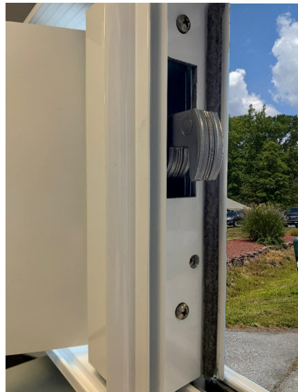
HEAVY DUTY COMMERCIAL LOCKS STANDARD

Accordion Shutters are considered one of the strongest shutters available. So don't settle for thin comparisons.