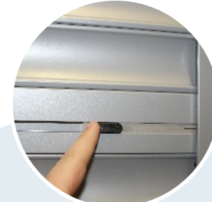
Finger slide bolt